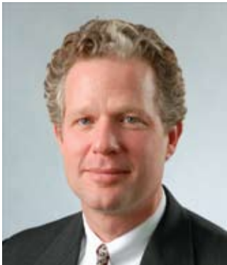
Global Product Leader Ocean Cargo (New York)