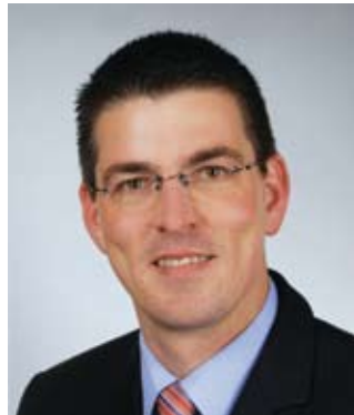
Global Product Leader Hull & Liabilities (Hamburg)