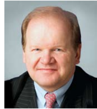
Global Marine Head, Europe & Asia-Pacific (Hamburg)