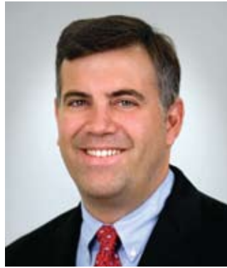
Global Marine Head, North America (New York)