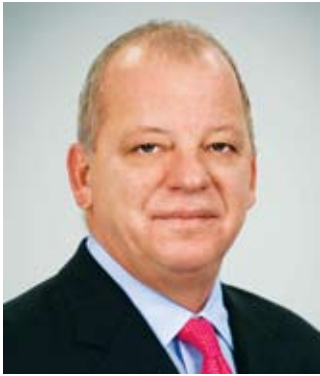
AGCS Global Marine Head Chief Underwriting Officer (New York)