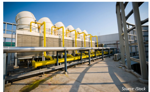
Cooling towers are leading exposure settings and have been linked to Legionella outbreaks.

There is also concern about the contraction of LD from Legionella species that reside in soil, like L. longbeachae . Beyond L. pneumophila , there are multiple strains linked to fatal cases of LD, including L. jamestowniensis and L. bozemanii . Because elimination of the bacteria is impossible, steps must be taken to understand the conditions under which the bacteria can multiply and cause disease, as well as the treatments and measures that can be taken to minimize Legionella overgrowth.